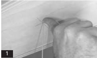
1. Drop a plumb bob from the center of the soffit to determine the column's center point on the floor. Mark this point for reference to align the column in the proper position under the soffit.