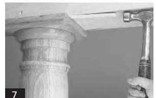
7. Be sure the assembled column is centered under the soffit. Use shims between the capital and soffit to secure the column in place.