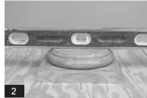
2. Make sure the base is level before continuing with the installation.