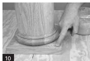
10. Fill the screw holes in the soffit and the nail holes in the base with wood filler and sand smooth.