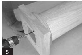
5. Attach the wood base to the bottom of the shaft by pre-drilling and countersinking holes through the base into the shaft. Secure with rust resistant screws.