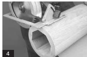
4. If trimming is necessary, trim from the base of the shaft. The load must be evenly distributed around the entire column circumference.