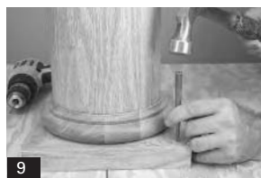
9. Use finish nails to secure the base to the floor.