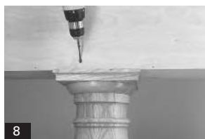
8. Pre-drill and countersink holes at an angle through the soffit into the capital. Secure with rust resistant screws .